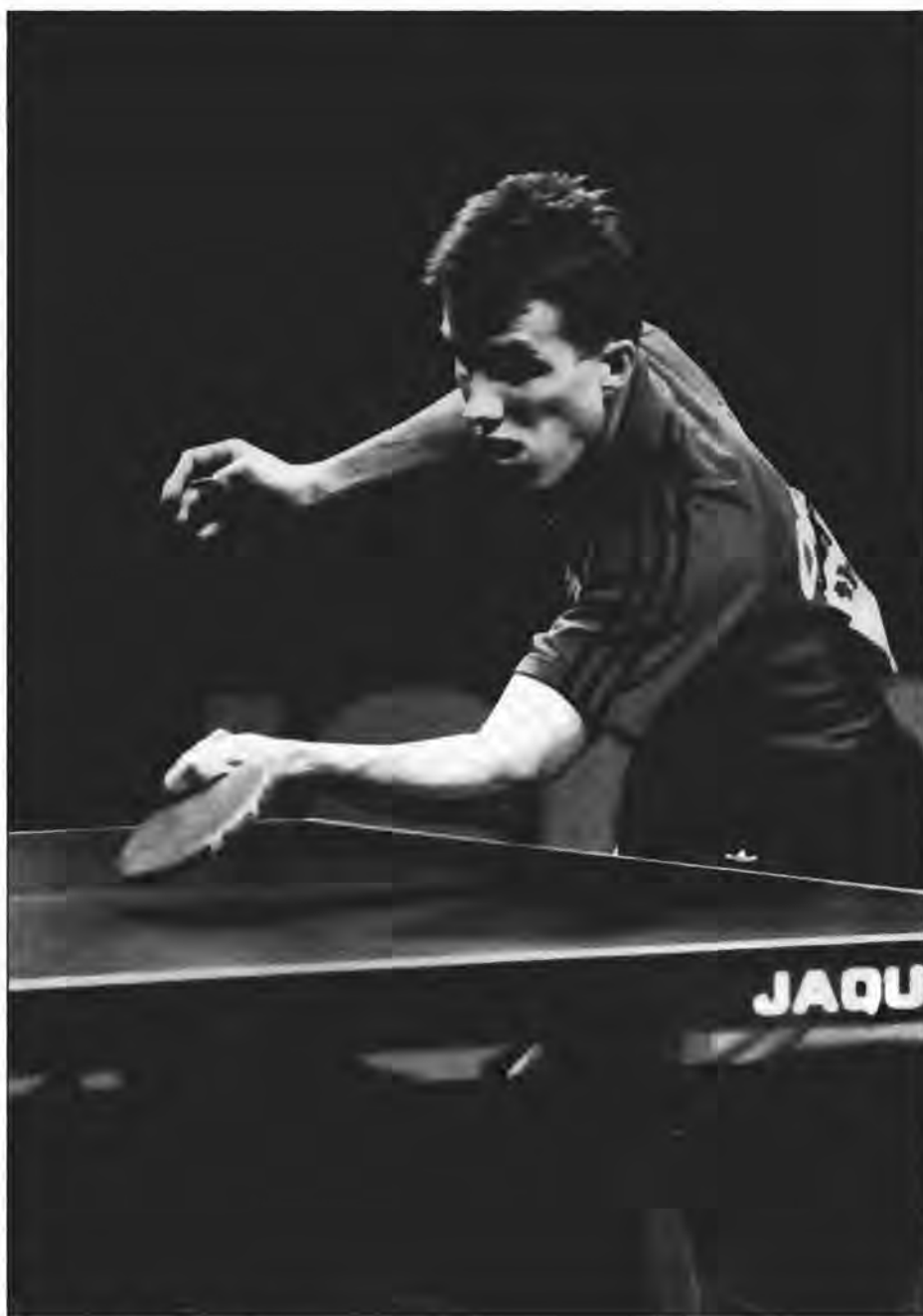
German ace Jorg Rosskopf

Poland consigned the Czechs to Division 1 in winning the second leg 4-3.